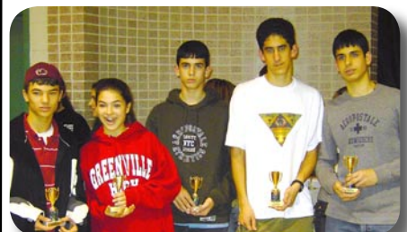
SAINT BASIL AWARD WINNERS