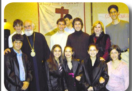
BIBLE BOWL WINNERS