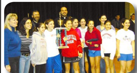
GIRLS BASKETBALL 2ND