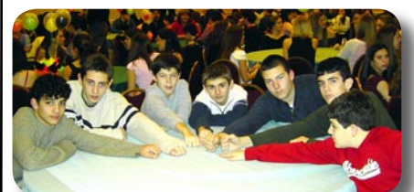
JUNIOR BOYS BB 3RD PLACE