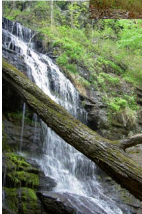
OCONEE STATION FALLS