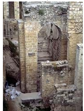
RUINS OF POOL OF BATHESDA IN JERUSALEM

It was here that our Lord encounters a man who has been in a state of paralysis for some 38 years. Without anyone to assist him, the paralytic can never enter the waters in time to be cured of his affliction. The pool was deep, a kolumbethra, a