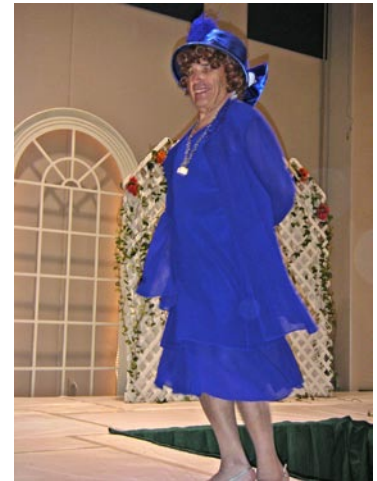
WINNER OF SAINT GEORGE BEAUTY CONTEST